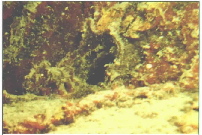
Figure 3. The starboard side of the Japanese midget submarine showing the shell hole from the four inch side gun of the USS Ward . The shell impacted at the point where the conning tower joins the pressure hull of the submarine. The shell did not explode but merely penetrated the pressure hull.

Eyewitness accounts from the USS Ward reported that the first shot from the bow gun passed over the top of the conning tower and splashed on the other side. The after-deck gun made a solid hit at the base of the conning tower on the starboard side. The Pisces V crew