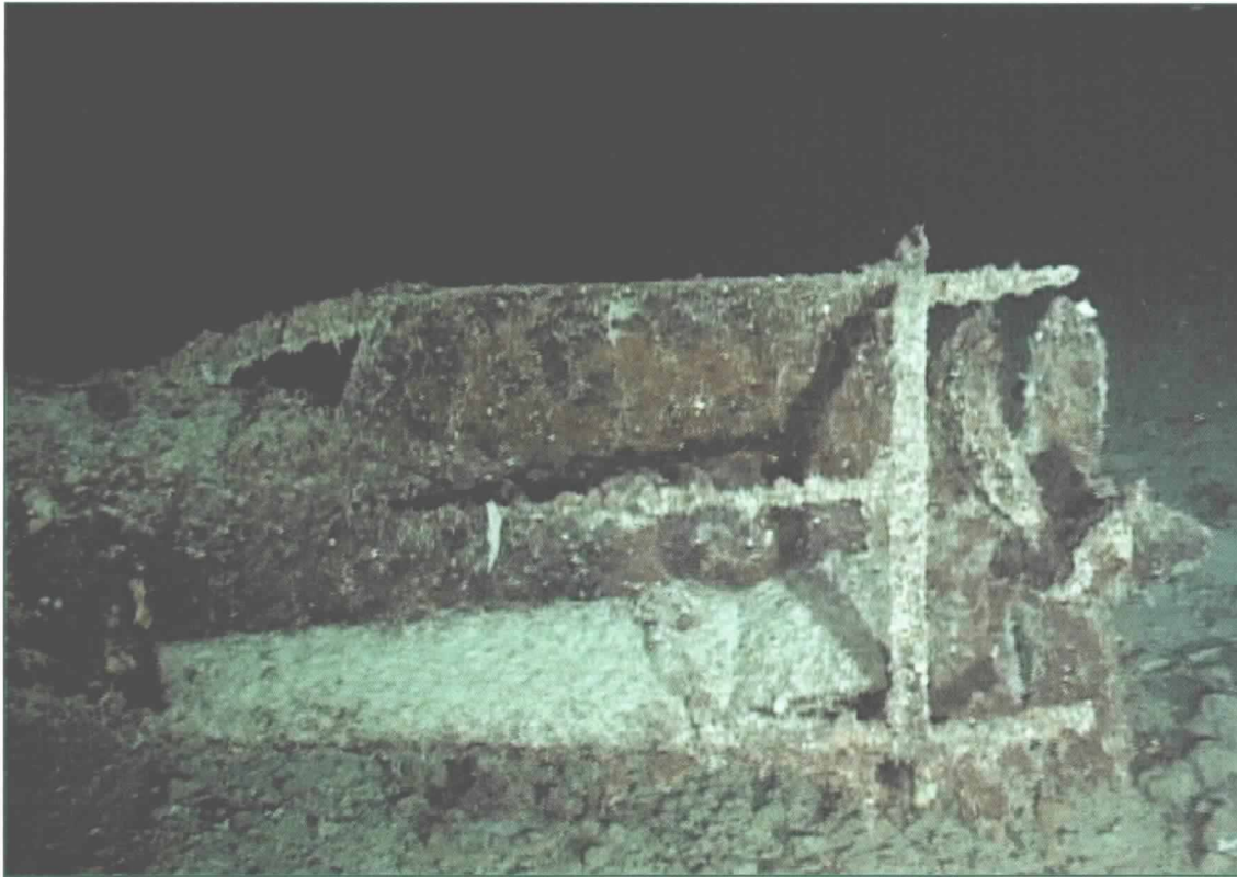
Figure 5. The stern assembly showing the two counter-rotating propellers. It appears that the stern dive planes are in the up position.

periscope made a handy current indicator or “wind sock” for the survey flights along the hull with the Pisces subs. The rope-guard rails around the access hatch at the top of the sail are intact and undistorted. The forward tensioning pulley is in place, but the forward and after rope guards are down. A closer examination of the digital image of the top of the periscope looks as though it was directed to the port quarter of the submarine. The lines fouled around the top of the periscope make it difficult to see.