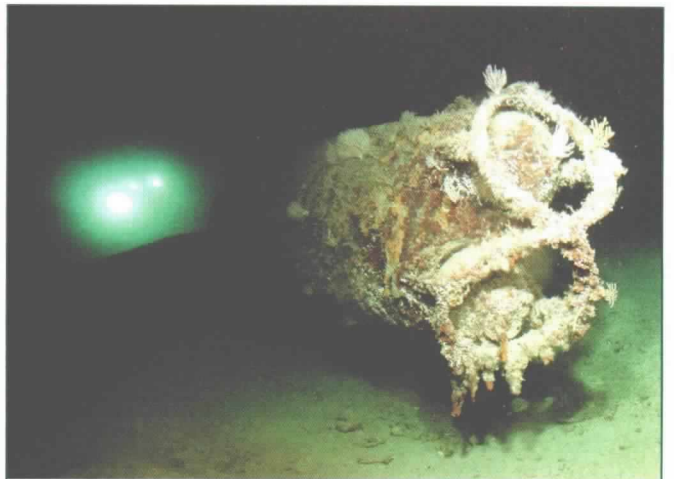
Figure 4. The bow of the midget submarine showing the two torpedoes still in tact, unfired with the torpedo tube covers still in place. In front of the torpedo tubes is a figure eight torpedo guard which also served as a line cutter.

verified that the shot did not pass through the conning tower. Eyewitness accounts report that they did not see any explosion from the shot that hit the starboard side of the conning tower. There does not appear to be any distortion in the hull or conning tower that would be caused by a detonation of the shot that entered the starboard side. The small grouping of holes around the elongated hole appears to have been caused by something entering from the port side. A closer inspection will have to be made to determine if these are puncture holes or rust holes.